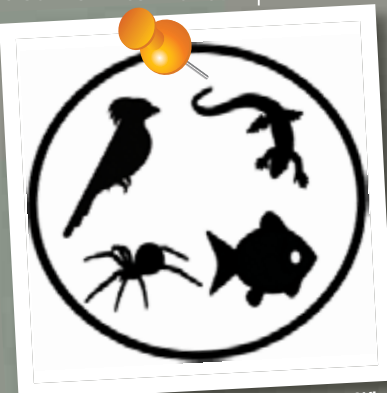
Be Pet Wise

Find out more at www.invasivespeciesireland.com